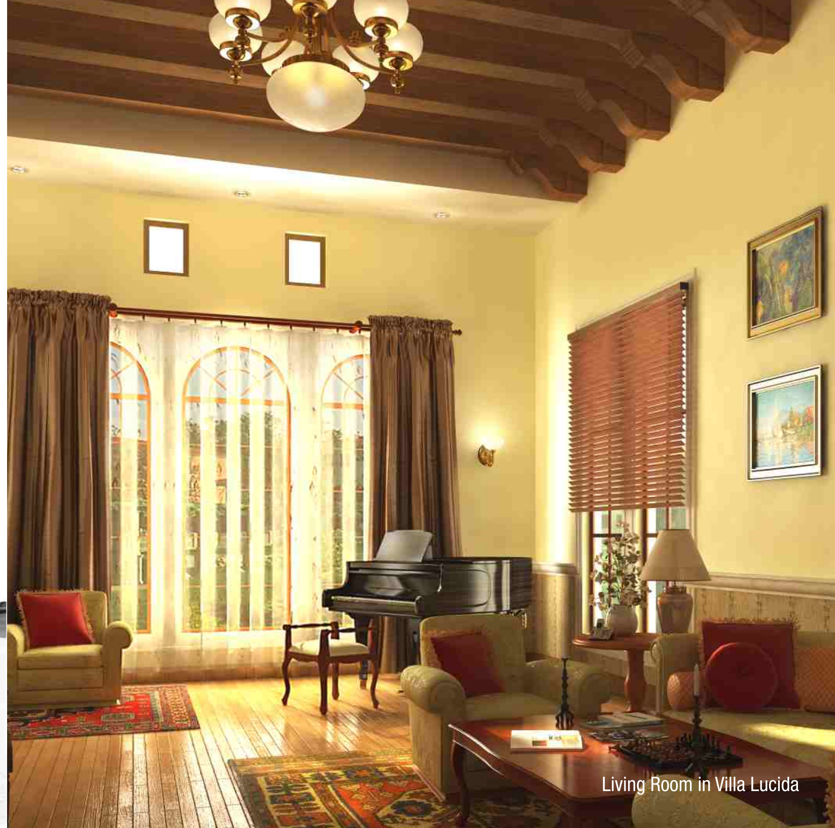
Living Room in Villa Lucida