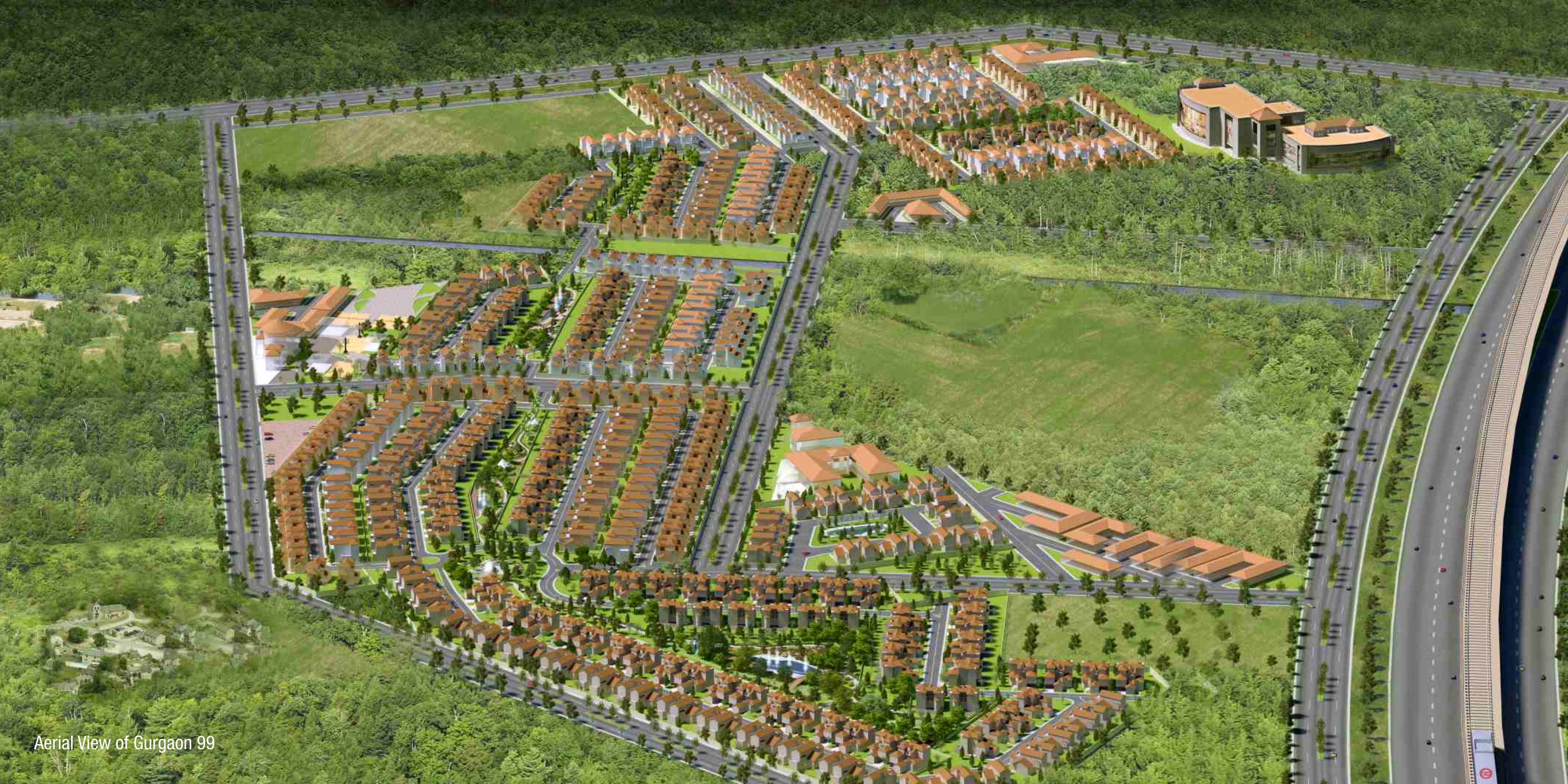
Aerial View of Gurgaon 99