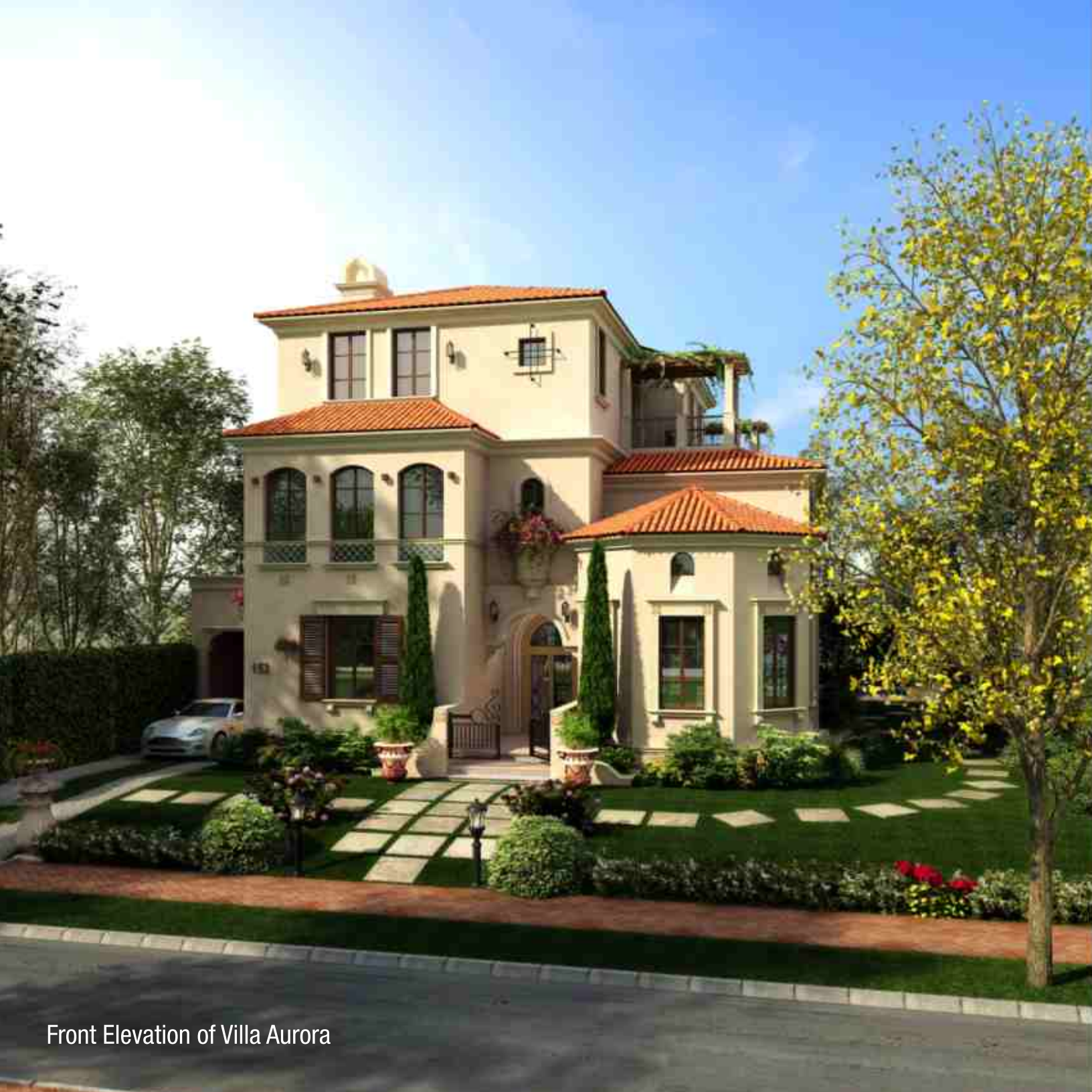
Front Elevation of Villa Aurora