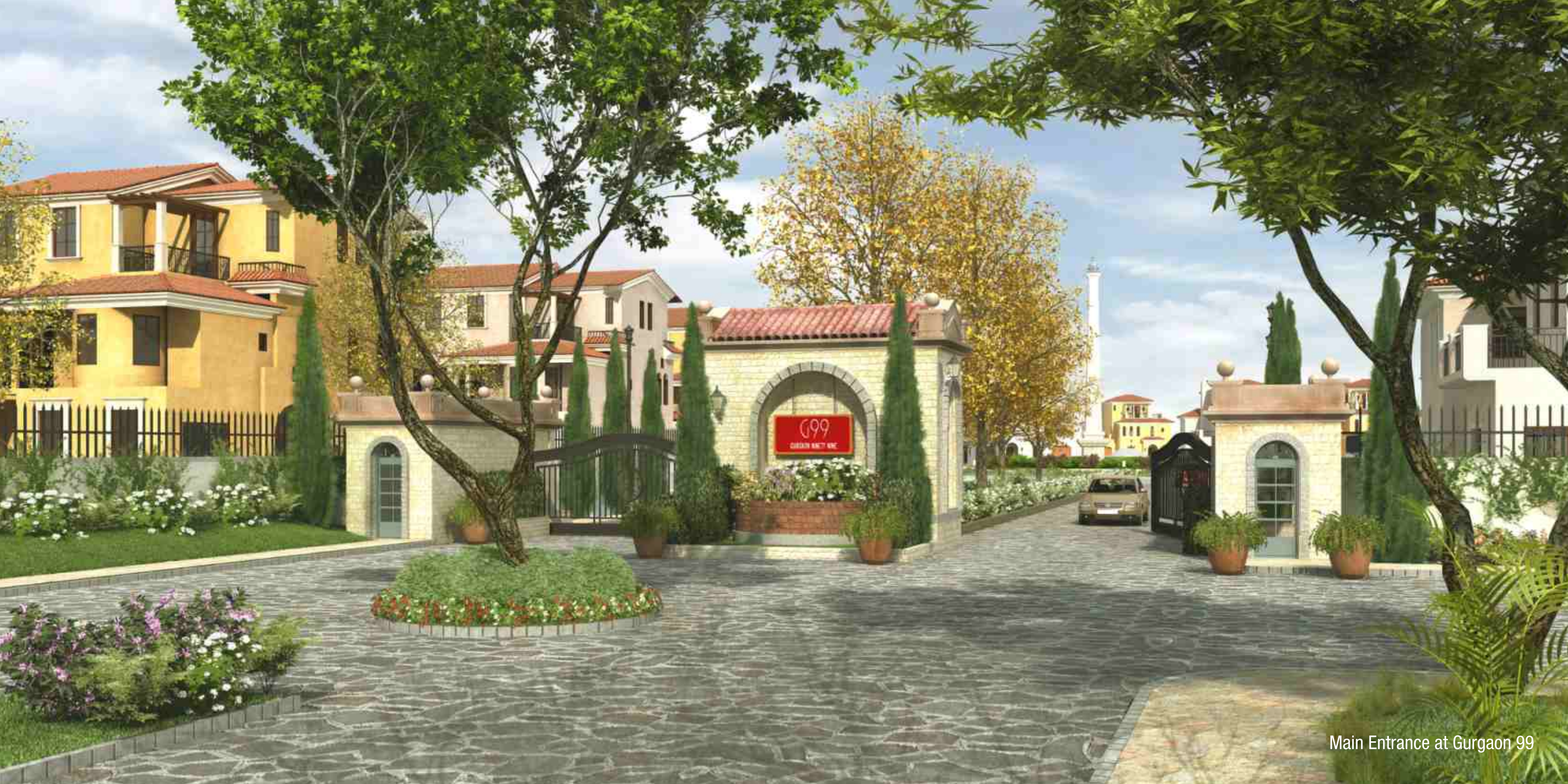
Main Entrance at Gurgaon 99