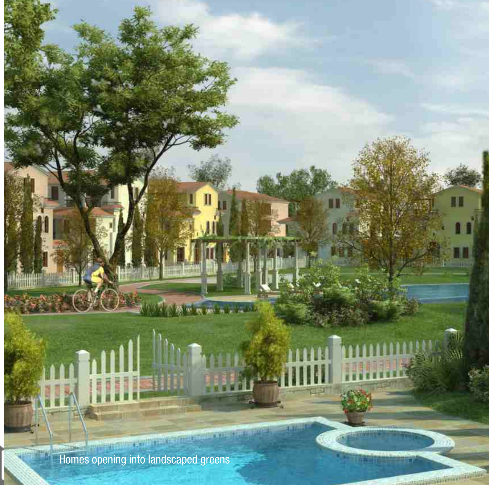
Homes opening into landscaped greens