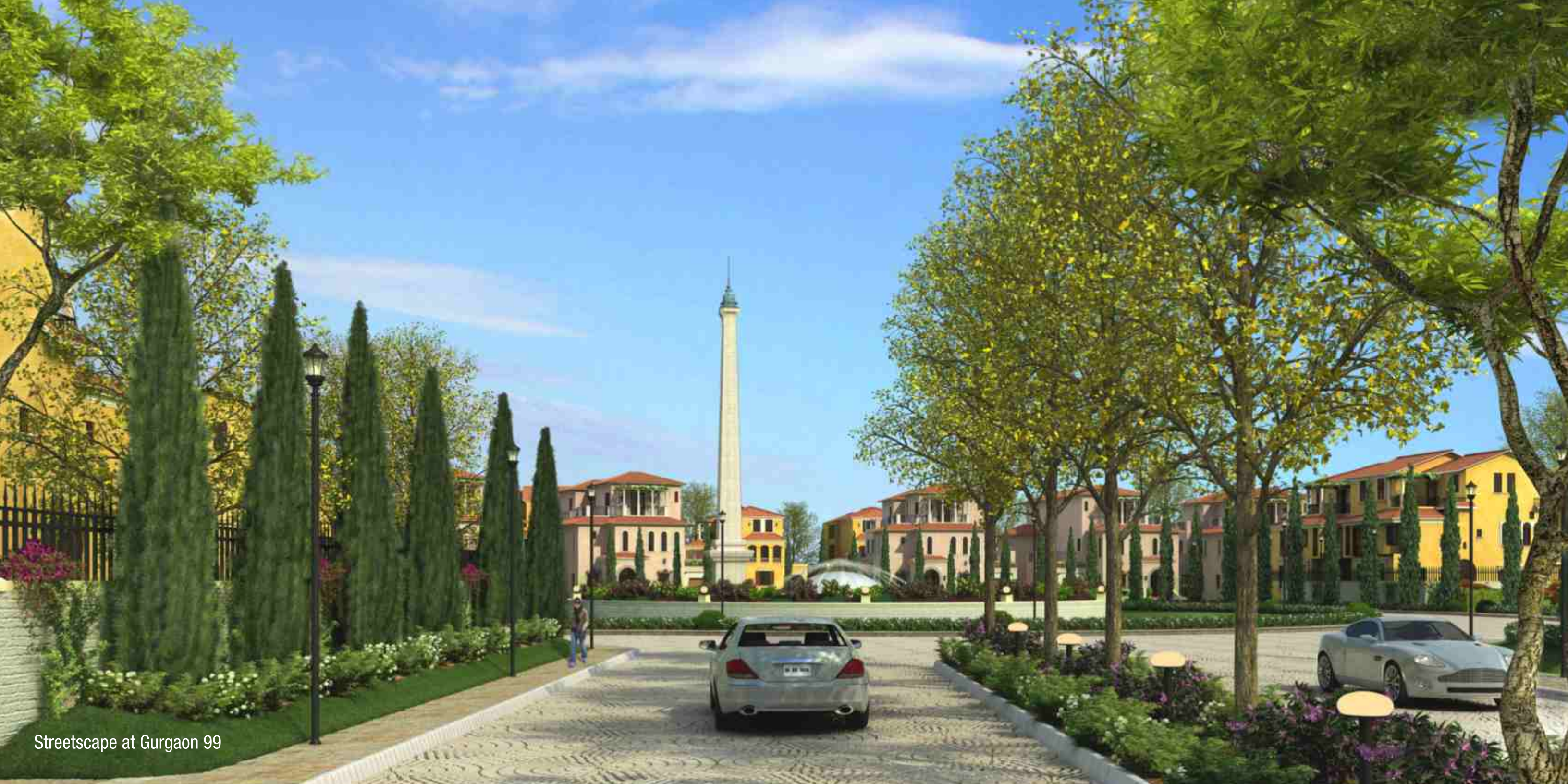
Streetscape at Gurgaon 99