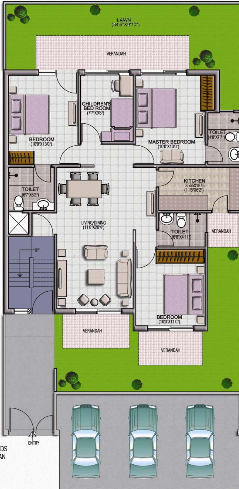
( TYPE :-B ) 240 YARDS GROUND FLOOR PLAN