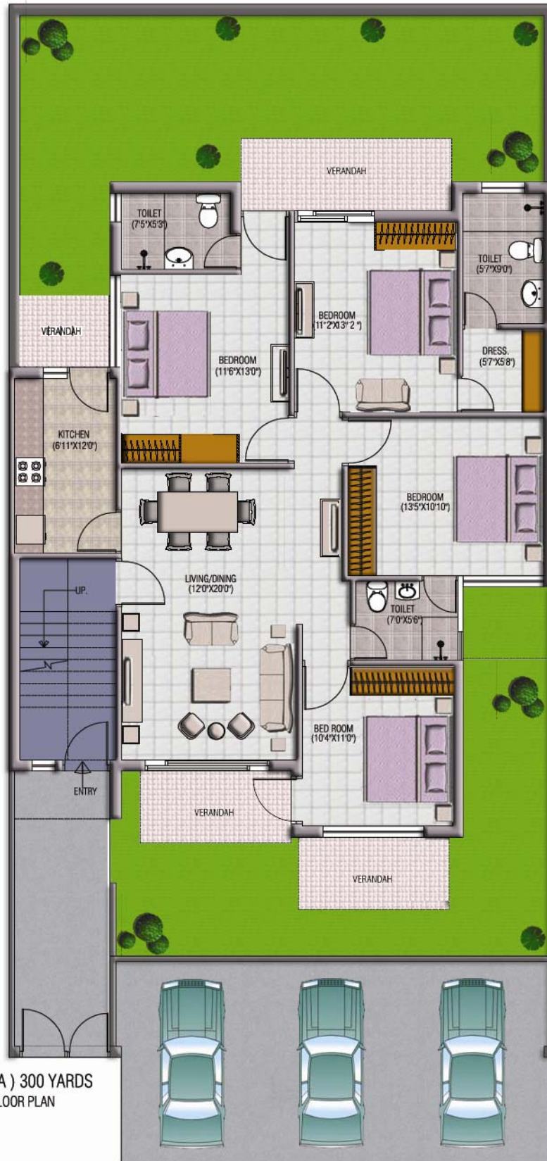
( TYPE :-A ) 300 YARDS GROUND FLOOR PLAN