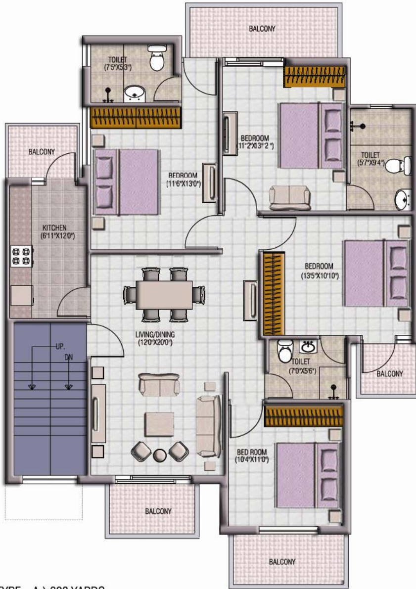
( TYPE :-A ) 300 YARDS FIRST FLOOR PLAN